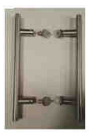
Make sure the parts of handle are in order.