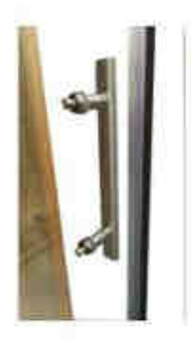
Place outside door handle on the glass door. Ensure plastic stoppers are against the glass.